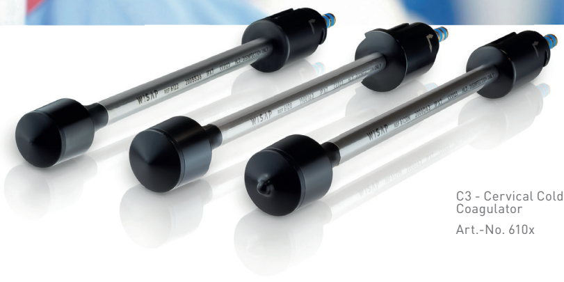
C3 - Cervical Cold Coagulator Art.-No. 610x